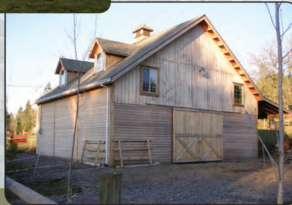
CUSTOM HORSE BARN WITH 2x6 T.G. SIDING

Few building projects can compete with equestrian facilities for the very personal and complex nature of their design.