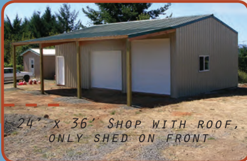
24' X 36' SHOP WITH ROOF, ONLY SHED ON FRONT