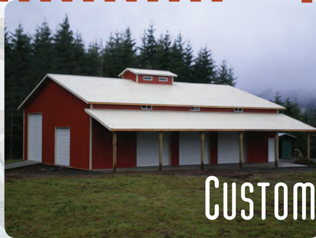
40 x 60' SHOP WITH 12 x 60' ROOF SHED AND CUSTOM CUPOLA

You invest a lot of time and effort working so you can enjoy life's diversions. That might mean spending time in your wood shop or tinkering with your car collection. It might mean storing and maintaining a boat, RV or your fleet of snowmobiles. Or it might just mean hanging out in your personal rec/entertainment room. Whatever it means to you, if it means you need a building, consider a Cascade building!