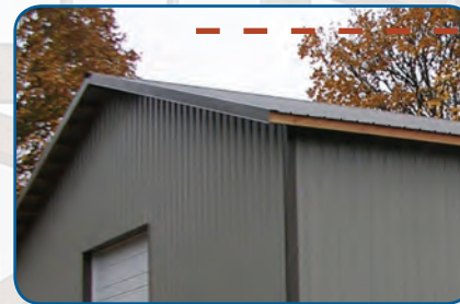
40' X 60' SHOP WITH 18" ROOF OVERHANG

18" roof overhang adds protection as well as a touch of class to your project. It comes standard with open soffit and 2"X6" barge/fascia boards.