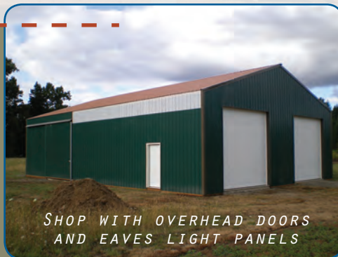
SHOP WITH OVERHEAD DOORS AND EAVES LIGHT PANELS

Fiberglass/ polycarbonate light panels: Light Panels whether on the roof or the wall help to light up your building while saving you money at the meter! Upgrade to polycarbonate if you are looking for extra durability.