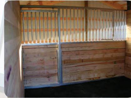
BACK VIEW OF THE STALL FRONT

You can see that Cascade Pole Buildings is truly looking out for the best interests of the horse lover. It all adds up to the best value available in the equestrian world and a comforting peace of mind for you!