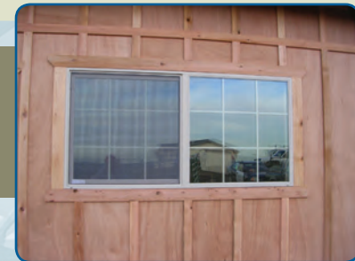
5' X 3' VINYL WINDOW (WITH OPTIONAL GRID)