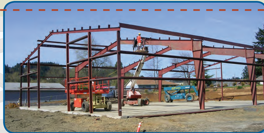
CASCADE POLE BUILDINGS DOES IT ALL!