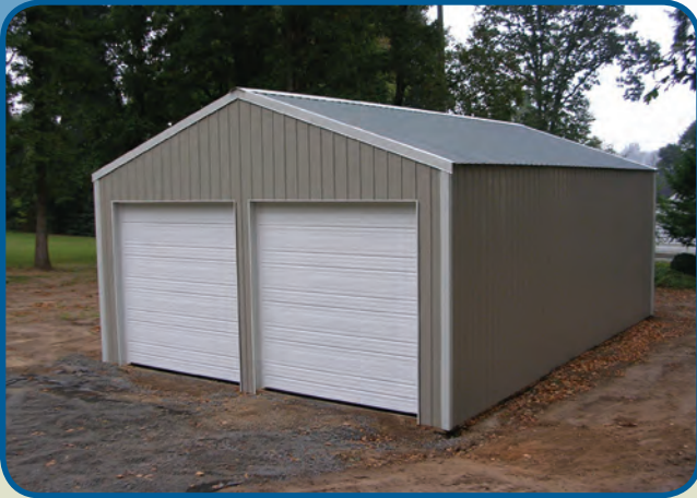
24' X 36' GARAGE WITH OVERHEAD DOOR