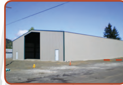
70' X 120 STEEL FRAMED WAREHOUSE