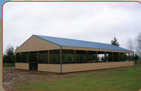
60x120 HORSE ARENA WITH 5' PONY WALL AND 2' TOP SKIRT

When you think of riding arenas, you naturally think of expansive, unobstructed space. That's when you should think of Cascade Pole Buildings with its wide array of clearspan arenas with widths up to 84'.